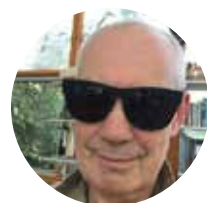
SERGEI BODROV, OSCAR NOMINATED DIRECTOR

Lisa Lu is an internationally renowned veteran of film, television and stage, working in the United States and China across a multitude of English and Chinese productions. A three time recipient of the Golden Horse award for Best Actress, she has shown great versatility in her style, allowing her to take on a large scope of productions ranging from modern drama to Chinese Opera and Southern Kun Qu. Her numerous famous roles include Disney's The Joy Luck Club , Bernardo Bertolucci's Academy Award winning The Last Emperor and the Shaw Brothers' Empress Dowager . Lisa was also featured in 100 Chinese Motion Picture Stars in commemoration of the 100th anniversary of Motion Picture Making worldwide and recently named an honorary citizen of Hohhot, the capital of Inner Mongolia. Her latest film, Crazy Rich Asians , will be released by Warner Brothers in 2018.