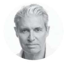
MICHAEL NOURI, ACTOR

Tuba Buyukustun is a Turkish TV and film actress. She graduated from The Mimar Sinan University of Fine Arts in 2004, with a degree in Stage and Costume Design. Through her various roles she has been able to reach a worldwide audience and she was the first Turkish actress to be nominated for an IEMMY at the 42nd IEMMY awards for her role in the TV Show 20 Minutes . Since 2014 she has been a UNICEF Goodwill Ambassador and also acts as an Advocate for Children's Rights.