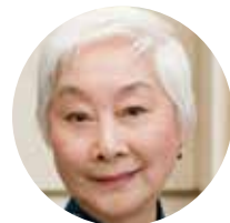
LISA LU, JURY PRESIDENT

Lisa Lu is an internationally renowned veteran of film, television and stage, working in the United States and China across a multitude of English and Chinese productions. A three time recipient of the Golden Horse award for Best Actress, she has shown great versatility in her style, allowing her to take on a large scope of productions ranging from modern drama to Chinese Opera and Southern Kun Qu. Her numerous famous roles include Disney's The Joy Luck Club , Bernardo Bertolucci's Academy Award winning The Last Emperor and the Shaw Brothers' Empress Dowager . Lisa was also featured in 100 Chinese Motion Picture Stars in commemoration of the 100th anniversary of Motion Picture Making worldwide and recently named an honorary citizen of Hohhot, the capital of Inner Mongolia. Her latest film, Crazy Rich Asians , will be released by Warner Brothers in 2018.