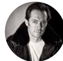
CADE CARRADINE, ACTOR